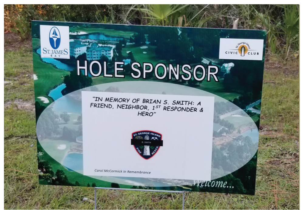
The 2nd Annual SGI Civic Club Golf Tournament and Charity Fundraiser was a great success.