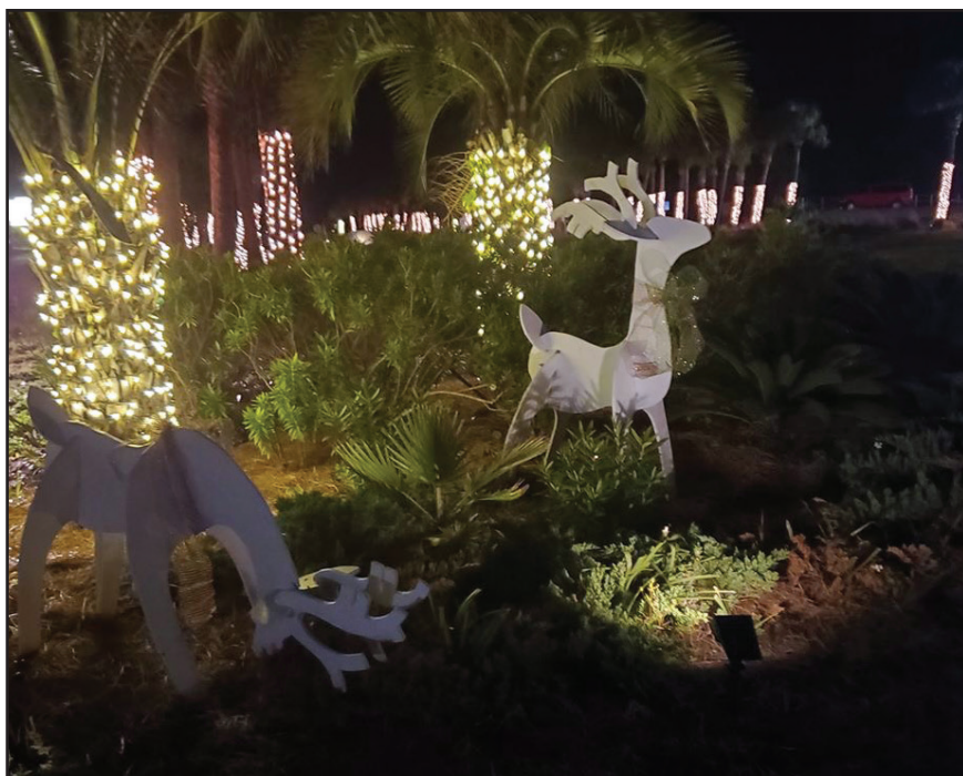
The Lighting of the Palms event exceeded expectations — thanks to many volunteers and groups.