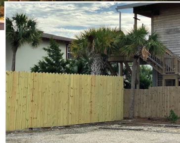
Doc Myers' has new menus, new management, new screening — same owners!