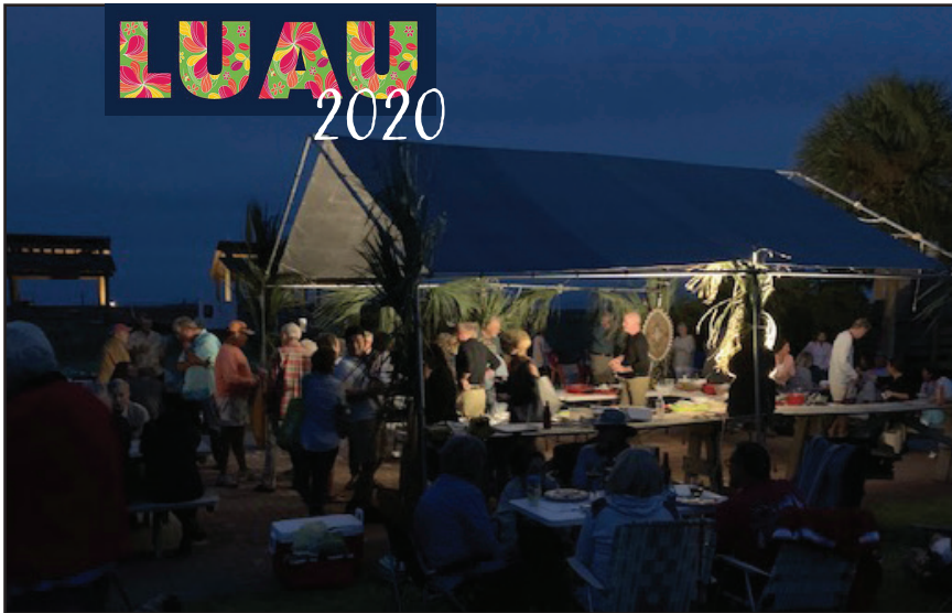
A forty-year St. George Island tradition, The Luau did not disappoint.