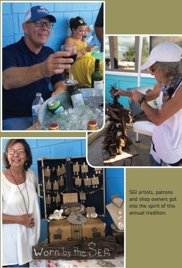
SGL artists, patrons and shop owners got into the spirit of this annual tradition.

The St. George Island Business Association sponsored its annual Art & Wine Splash on October 12. There were 33 artists located all around the business district showing anything from fine silver jewelry, handmade glass beads, ceramics and pottery, paintings in every medium and finely made wood furniture and driftwood sculptures. Eight of the local eateries offered wines to taste for those that had purchased the signature wine glasses for the experience. Many locations also offered free snacks and appetizers. The Business Association sponsors the Art & Wine Splash every October on the second Saturday during Columbus Day Week-End.