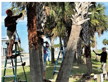
SGI Volunteers are working with the county to provide a professional quality trimming of palms in preparation for Christmas lighting and to improve the health of the trees.

The Lighthouse Association will again decorate their facilities, with the SGI Lighthouse serving as the literal high point of the design. The Apalachicola