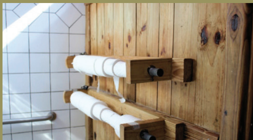
Lighthouse Park restrooms are inadequate.