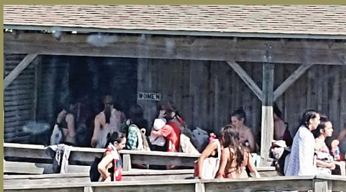
The restrooms are crowded and are non-ADA compliant.