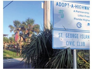
Bonus point if you remember when the Civic Club adopted this highway.

No experience is necessary to be a trasher. Litter for pick up on any part of Franklin is available most any day. Next time you go for a walk, include Franklin Blvd. Get exercise, support the Civic Club, and show the love for the island—all in one.