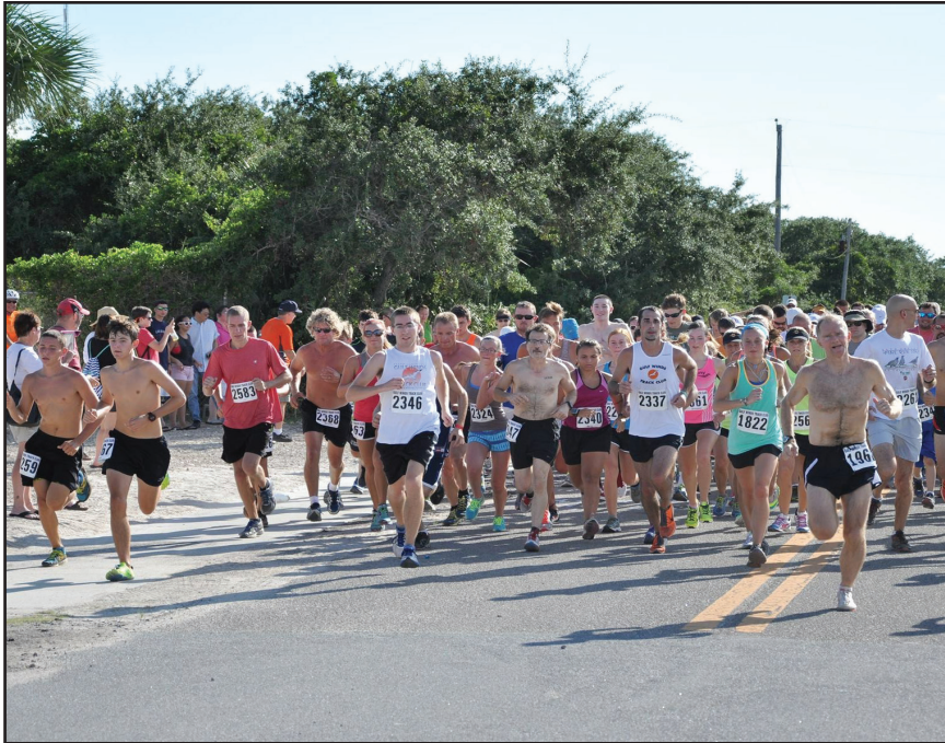
The ECCC's biggest event and fundraiser is August 3. Get all the info in this issue of The Islander.