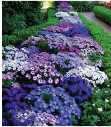
These flowering plants will NOT survive on the island and are NOT part of the proposed plan.

FDOT funds beautification projects like this one which are natural, low maintenance, and sustainable.