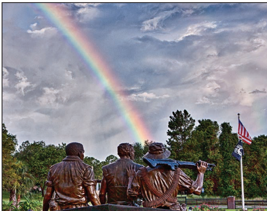
of the Three Servicemen Sculpture honoring American Veterans