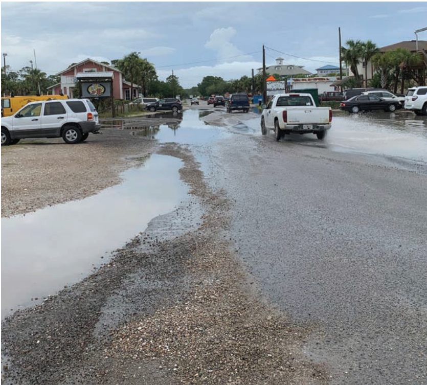
The Flooding at the Island Center business district will only get worse without intervention.