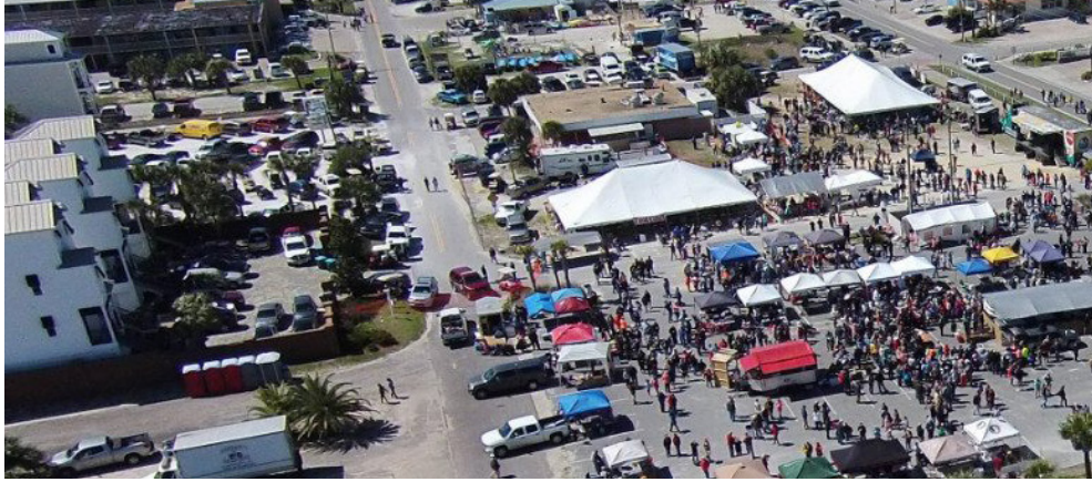
Above - The Chili Cookoff at Lighthouse Park

some crazy costumes, fantastic food, and the band blew the roof off the stage with music that had people paying to get in until almost 4pm. There was a dance contest on the cookoff side, the crockpot chili were a huge hit this year with participants and tasters, and the auction tent was hopping with a great new auctioneer who moved fast while keeping things fun. The golf event on Friday was a massive success. Everyone had a blast and wants to play again next year—register early to get your spot! Art preview was a great evening of conversation, friends, and some awesome silent auction items sold that night!