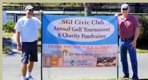
Key corporate sponsors – Capital City Consulting, Duke Energy, and Donald & Associates – helped make this event a great success.