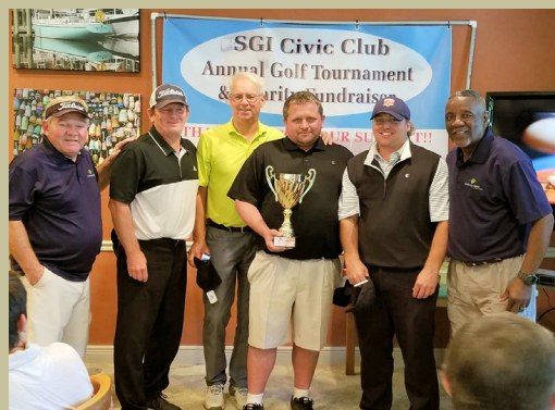
First place winners at the 1st Annual SGI Civic Club Golf Charity Tournament show off the Civic Club's Golf Trophy they will hold until next year.