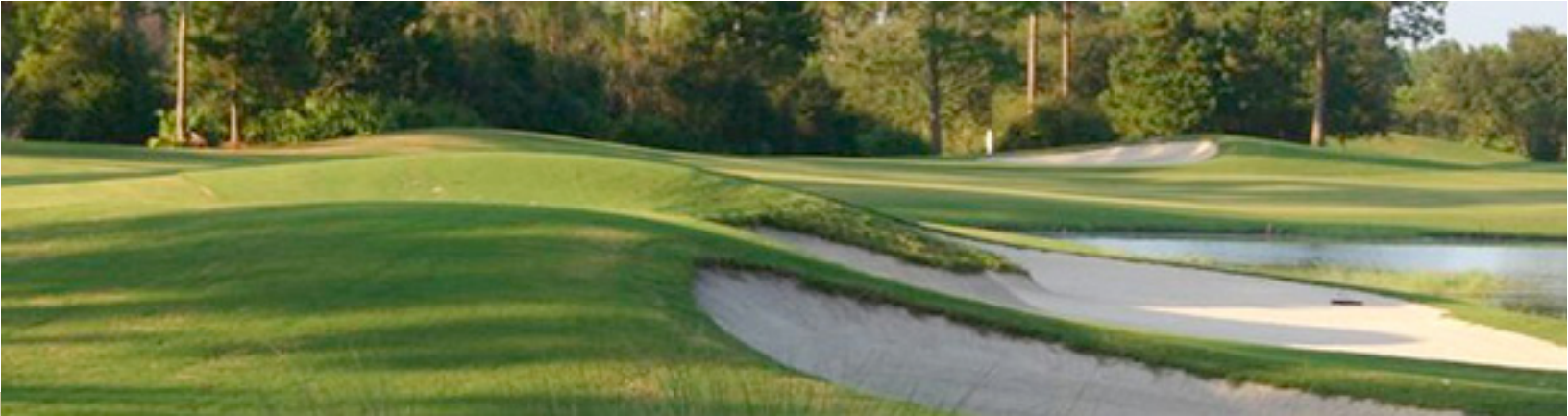
Above - St. James Bay Golf Club was a perfect location for the SGI Civic Club event.