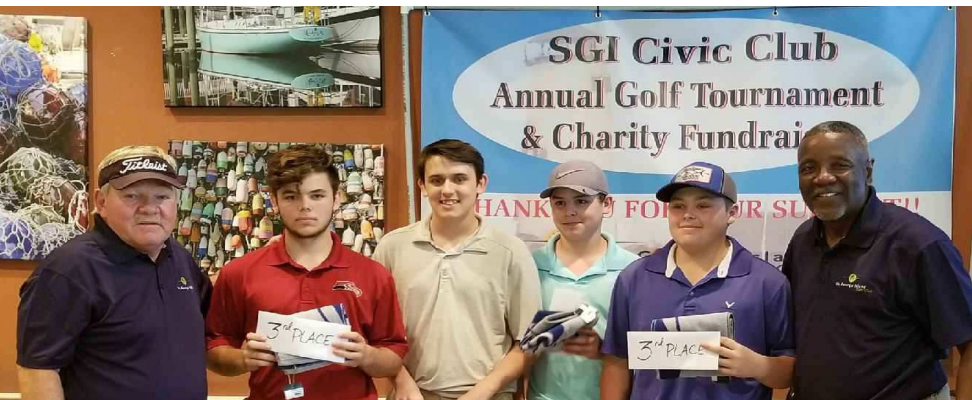
Franklin High School Varsity Golf team came in 3rd place during the SGI Civic Club Annual Golf Tournament and Charity Fundraiser where $6700 was raised. This first-time event was a great success. Visit online at www.sgiCivicClub.com for more information about the event.