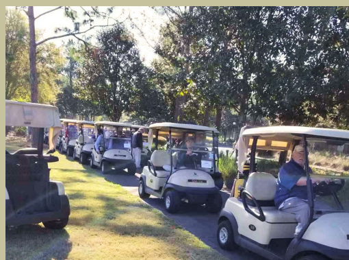
Golfers lined up at the St. James Bay Golf Club in Carrabelle to support the SGI Civic Club's fundraising efforts.