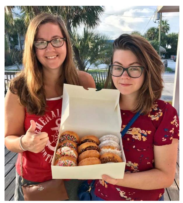
Happy Door Prize winners from the last 2017 Summer Bingo Game