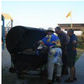
Tending the BBQ