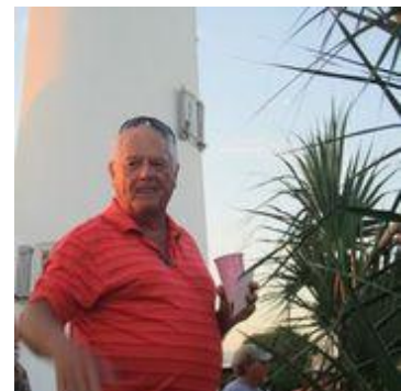
Newt enjoying a break