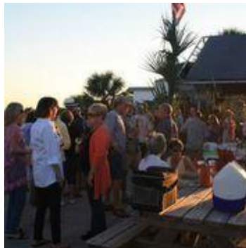
Waiting for Dinner