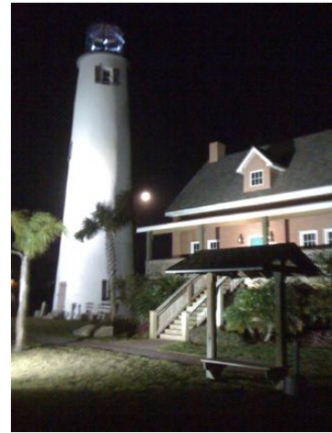
Lighthouse and Keeper's Museum