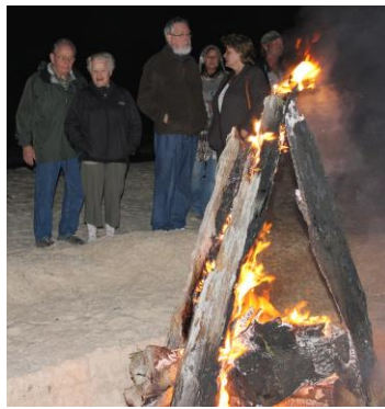
Keeping warm at the Bonfire