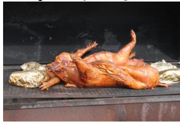
The featured guest