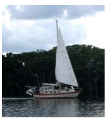
Sailboat on Apalachicola River during volunteer's cruise up the River with Journey's of St. George Island sponsored by the St. George Island Welcome Center

Research and Visitor Center in Eastpoint. The festivities will run from 1:30-6 p.m. and will feature family-friendly activities and exhibits. The Visitor Center is located near the St. George Island Bridge at 108 Island Drive, Eastpoint. For more info call 850-670-7700.