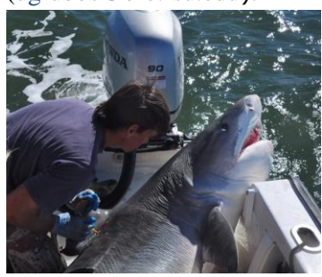
Tiger shark caught off Dog Island

Another interesting story was about the shark that had a luminescent bottom that mimicked the light above.